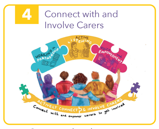
Connect with and empower carers to get involved