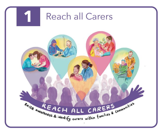
Raise awareness and identify carers within families and communities

Four priority areas are identified for action. For each, we have set out the strategic intention, the actions to be undertaken, how we will measure if we have made a difference and who we will work with.