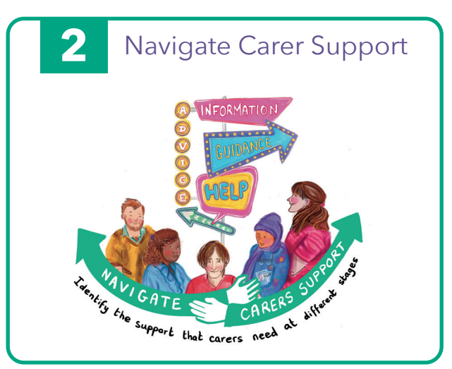
Identify the support that carers require at different stages